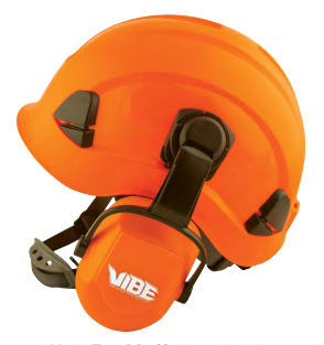
Capmount H70 Ear Muff 20776, 20777, 20778 (Hard hat and ear muffs sold separately)