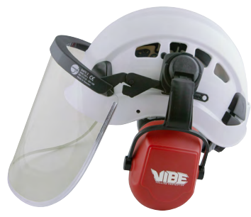
Face shield and ear muffs sold separately